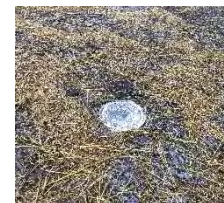
Final Condition - Roadbox

For test boring drilling, you may see drill rigs and support trucks, testing equipment and water holding tanks, with three- to six person teams at each location. Temporary construction fence will typically be set around the work area for safety and security purpose, with erosion and sedimentation control measures in place and project signage at the perimeter. It is MWRA's intent to select test boring locations that will pose minimal disruptions to the community, but at some locations, it may require temporary changes in pedestrian and vehicular traffic patterns. Instruments to measure groundwater level will be installed upon completion generally with a 12-inch diameter roadbox flush at ground surface. Upon completion of the field work, our crews will restore each work site. We apologize in advance for any inconvenience and thank you for your cooperation as we work to improve our water system.