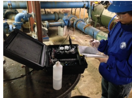
Figure 2. pH sampling

SIUs with flow sampled at least once 5 = 183 Number of sample locations (connections) at SIUs sampled at least once 6 = 371 Number of sample locations at SIUs that were sampled more than once = 183 Total number of sampling events at SIUs = 1216 Non-SIUs sampled once = 87 Number of sample locations at Non-SIUs sampled = 103 Total number of sampling events at Non-SIUs = 183 Total number of industries sampled = 271 Total number of sampling events at all industries = 1399 Sampling events in support of NPDES permits = 286 Sampling events in response to emergencies = 14 Sampling events for the MWRA Local Limits program = 219 Sampling events for special projects = 1146 Total number of non-industrial events = 1674