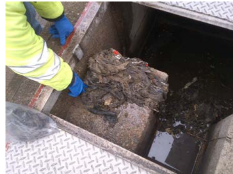
Figure 4. Rags at Randolph Septage Receiving Site

During the event and after, MWRA operations personnel had to remove and clean the grinders to keep the facility operating. Staff discovered that the grinders and pumps malfunctioned due to rags in the wastewater flow. MWRA staff investigated the source of rags in the system through physical inspection of tributary lines as well as by developing a list of industries within the BWR Pumping Station collection area. Industries were compiled from the PIMS database for permitted industries, and on-line business searches for non-permitted facilities likely to have or use rags. TRAC staff conducted inspections of 196 industrial, commercial and municipal facilities over the course of about 3 weeks. Non-permitted facilities were visited and questioned as to their use and disposal methods of rag material. Similar rags with matching petroleum fingerprints were found in the septage disposal site operated by the Town of Randolph. TRAC issued a Cease and Desist Order to the Town and ordered that the site be cleaned to remove all grit and debris, and other controls be put into place to prevent the disposal of similar material in the future. The Town of Randolph decided not to reopen the septage receiving site. MWRA staff aided the Town of Randolph in the clean-up of the site. No other specific source of rags was found. As a result, however, TRAC staff increased the frequency of its inspections of septage receiving sites from monthly to every two weeks to check for the presence of rags.