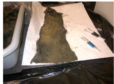
Figure 3. Sample of Rags removed from grinder/pump at the Braintree-Weymouth RPS